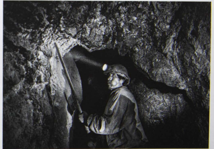
Photo: From The Silent Death Mine

This long-term project aims to raise awareness of the health problems in mining operations. It showcases the realities of mines in Cerro de Pasco (Peru) and Potosí (Bolivia) where wealth enveloped a poor land, communities became dependent on the subsoil, and individuals were plagued by illness. This series shines a light on locals and asks the question; "silver in the pocket or lead in the body?"